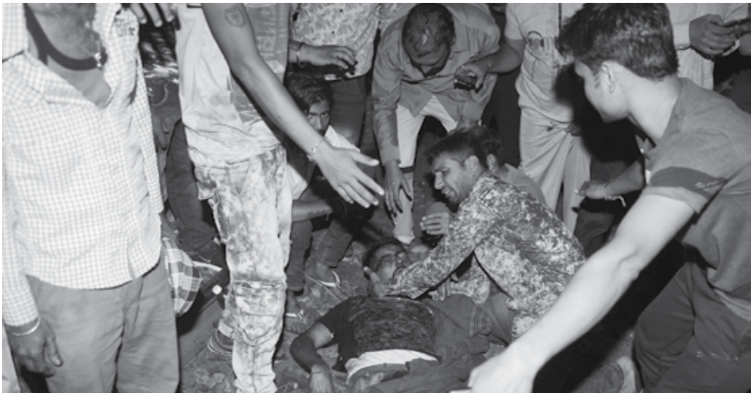
Indian relatives and revellers look at bodies of the victims of a train accident during the occasion of the Hindu festival of Dussehra in Amritsar

An eyewitness told a local TV channel there was "utter commotion" when the crowds noticed the train "coming very fast" towards them.