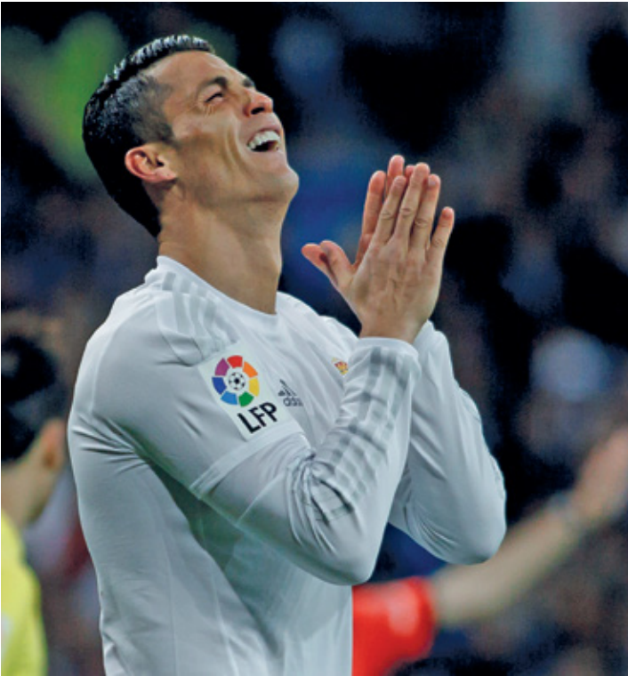
Ronaldo shrugged off explosive rape allegations to score for the champions in their last Serie A game

"I'd like to give my jersey to Ronaldo and maybe get his."