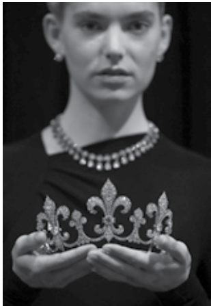
A model poses with a Diamond Tiara, ‘Hubner’, circa 1912 with an estimated value of $350,000-$550,000 USD)

On show at their London headquarters, the lots include 10 jewels which belonged to Marie Antoinette, the last queen of France be-