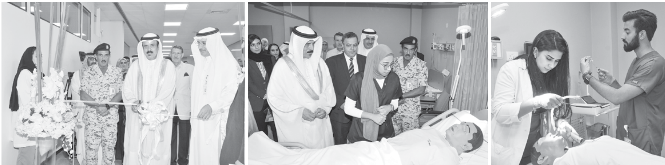
The Minister of Education, Dr Majid Al Nuaimi, inaugurated the Clinical Simulation and Skills Centre at Arabian Gulf University (AGU). This inauguration comes in line to keep pace with the academic curriculum of the College of Medicine and Medical Sciences.