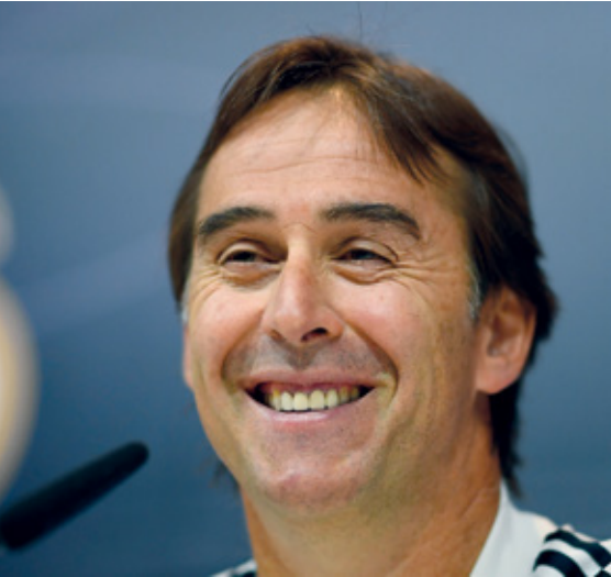
Real Madrid's Spanish coach Julen Lopetegui