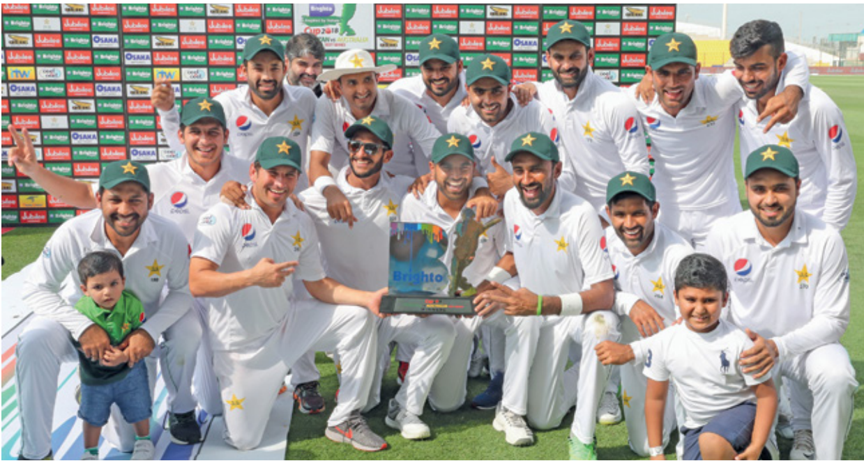
Pakistan's cricket team celebrates at the end of day four of the second Test cricket match between Australia and Pakistan at Sheikh Zayed stadium in Abu Dhabi

Pakistan take series win over Australia in second test