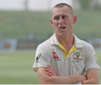
Australian cricketer Marnus Labuschagne gestures as Pakistan team is presented with the series trophy