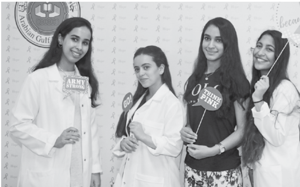
Arabian Gulf University (AGU) celebrated World Breast Cancer Awareness, which is held every October to spread awareness about the disease, its causes, preventive methods, besides raising funds in support of institutions and bodies dedicated to its treatment and prevention.

Ahlia University offers 18 programmes across six colleges, at the bachelor's, master's, and doctoral levels.