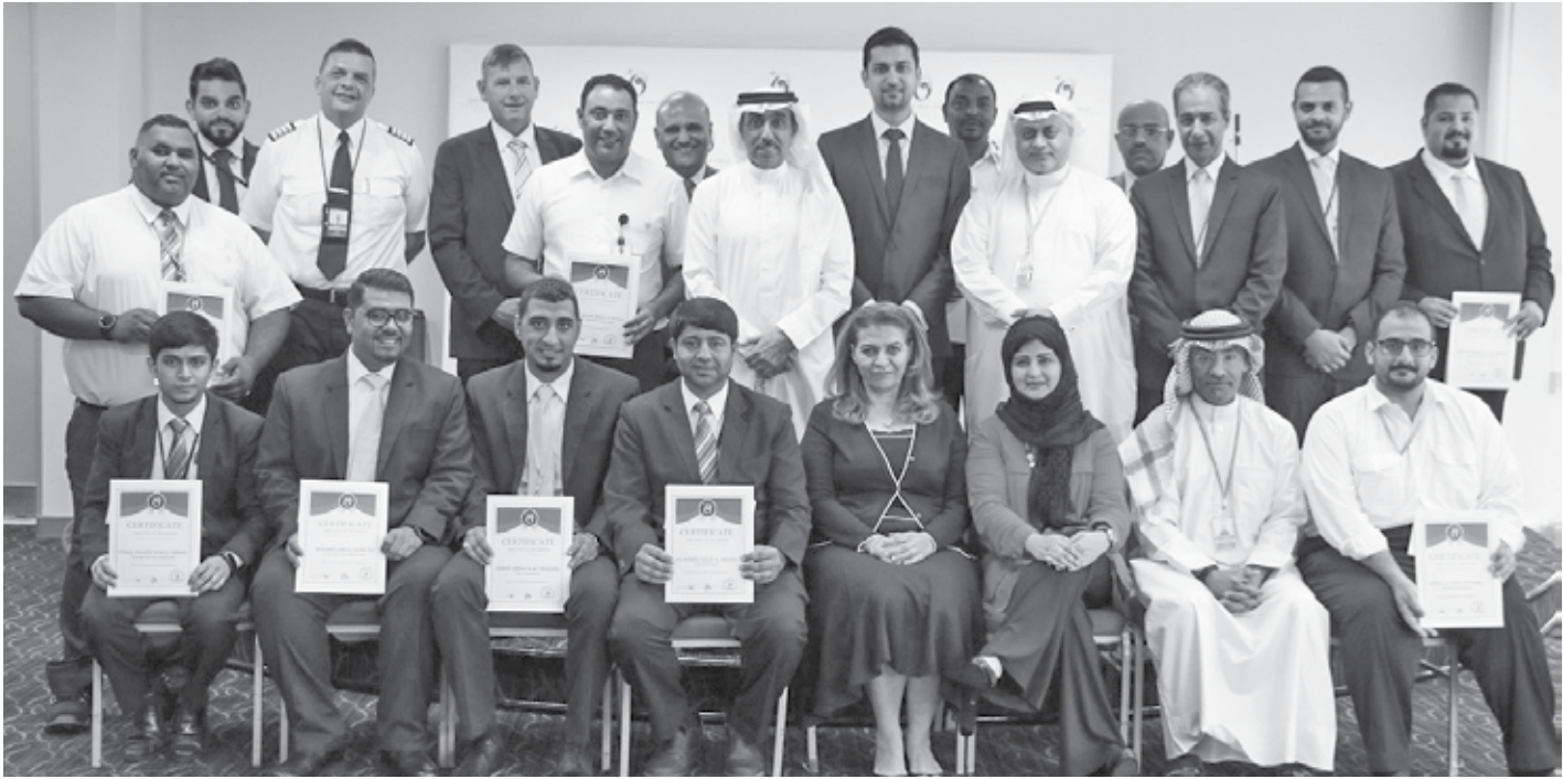
Bahrain Airport Services Company (BAS) honoured the staff for their excellent performance.

1948 is the year in which independent Korean governments were created.