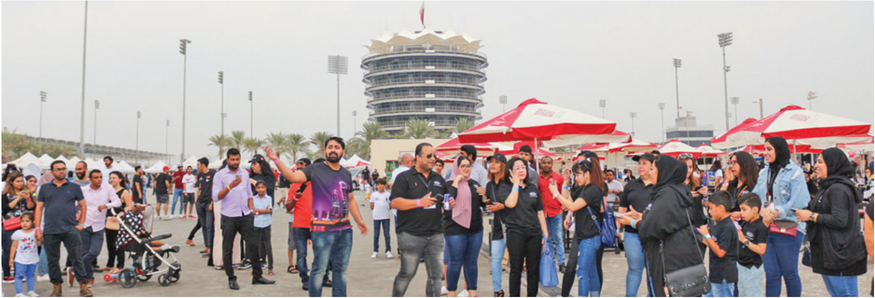
Over 2,000 visitors made the event a big success.

Over 300 women got behind the steering wheels to form the largest ever women-only car parade