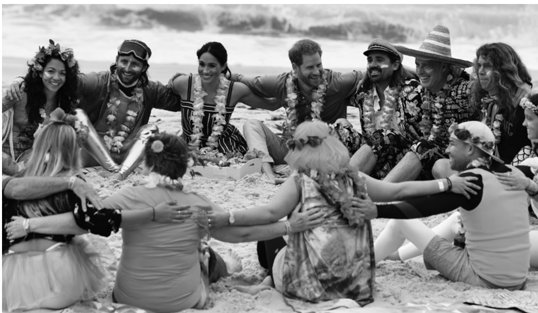
Britain's Prince Harry and his wife Meghan, Duchess of Sussex join a circle during a "Fluro Friday" session run by OneWave, a local surfing community group who raise awareness for mental health and wellbeing, at Sydney's iconic Bondi Beach

"You hear people that met the Queen when she came here