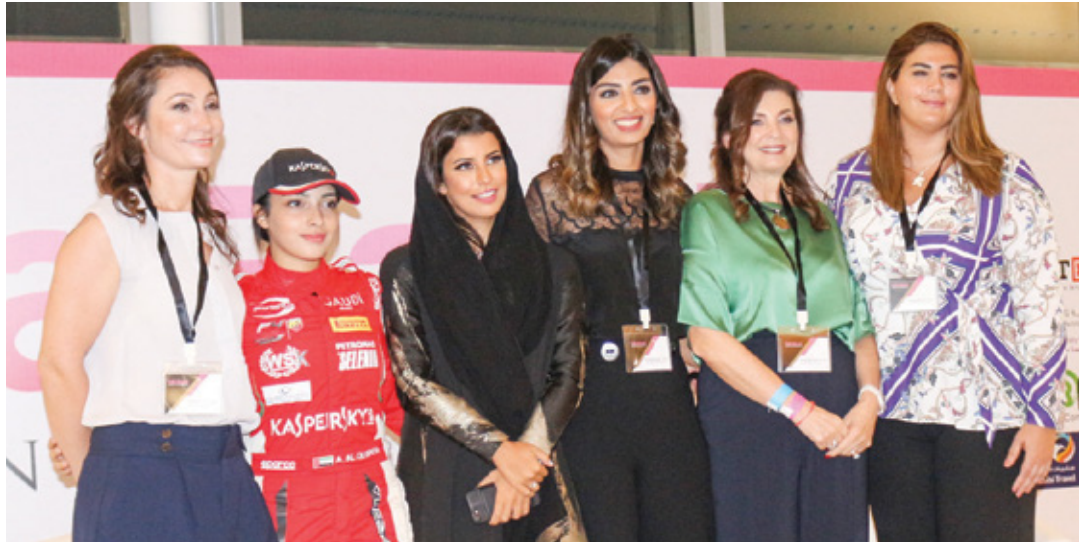
Some of the participants at the event.