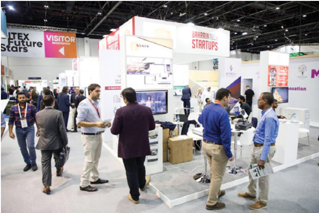
Over 40 entities from Bahrain were part of the Bahrain National pavilion.

Gaining exposure to a regional and international audience has been one of the biggest advantages of the event, they told Tribune on the sidelines