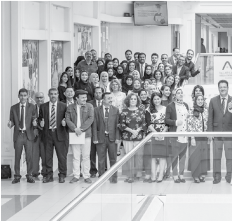
Ahlia University staff expressed support to #TeamBahrain initiative.