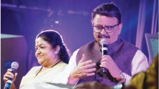
Ms Chitra, Mr Balasubramanyam enthralled their fans.