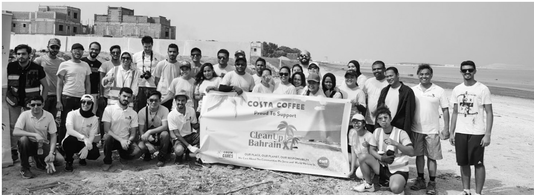
Volunteers, who took part in the drive.

620kg of waste removed from Jid-Alhajj beach