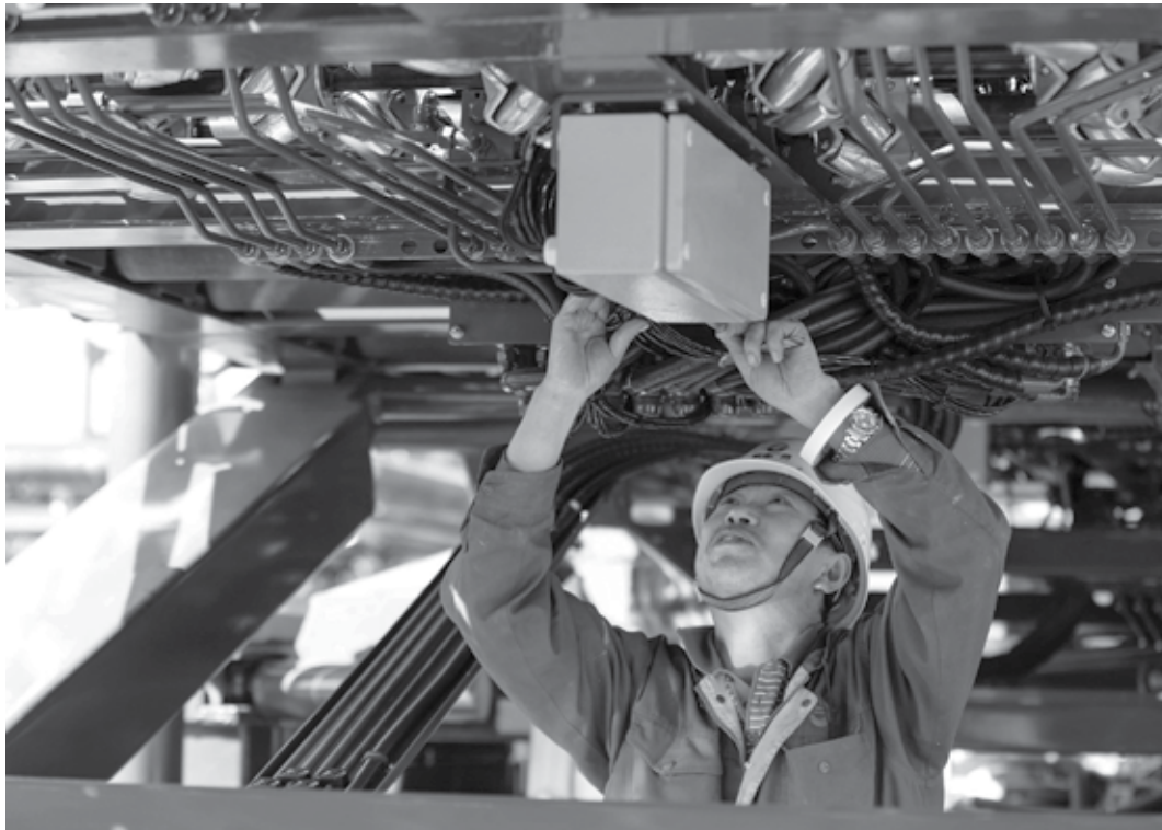
A worker checking a newly-made truck at a factory in Weihai in China's eastern Shandong province

China is in the midst of a increasingly bitter trade row with