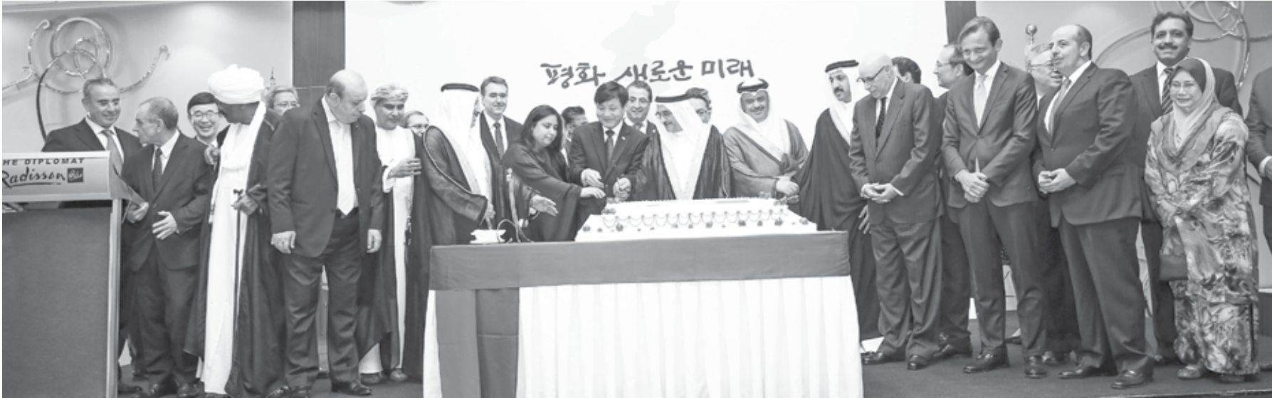
Korean Embassy in Manama celebrated the National Day of the Republic of Korea in the presence of diplomats and other dignitaries.

1948 is the year in which independent Korean governments were created.