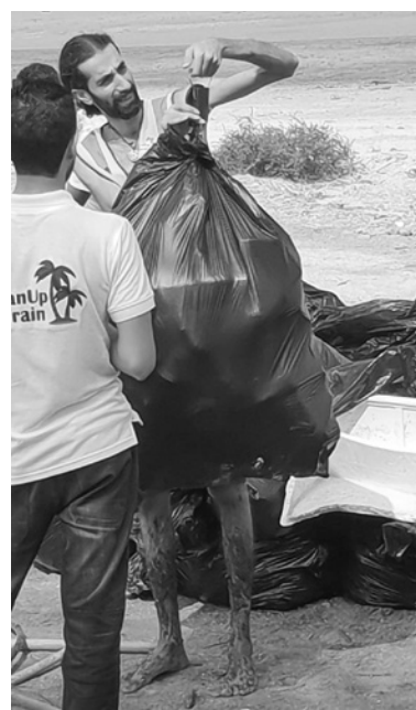
A volunteer in action on Jid-Alhajj beach.