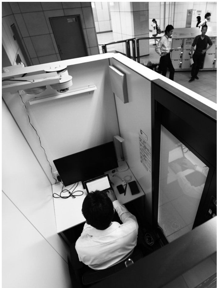
A Fuji Xerox employee (bottom) working in a cubicle installed at a subway station in Tokyo.

"The working environment will increasingly change as working practices evolve," he added.