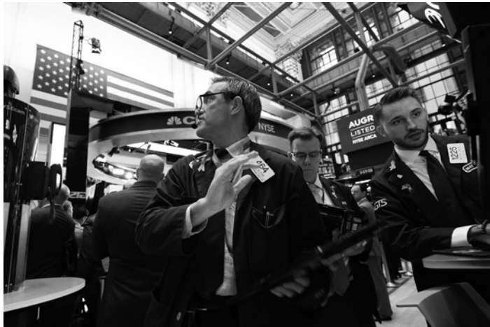
Traders work on the floor at the closing bell of the Dow Industrial Average at the New York Stock Exchange

Italy's populist government has submitted its draft 2019