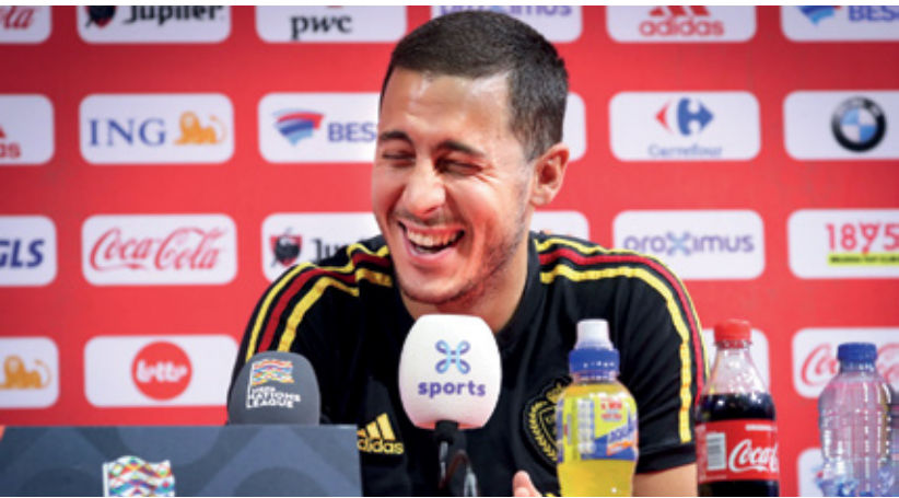
Belgium's footballer Eden Hazard reacts during a press conference

were able to win the Champions League, Belgium won the European Championships, he would be able to win everything, without playing in Spain."