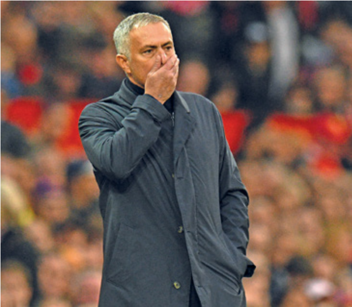
Manchester United's Portuguese manager Jose Mourinho gestures during the English Premier League football match between Manchester United and Newcastle at Old Trafford in Manchester

Spurs start a demanding seven-game stretch in 21 days against a West Ham side on Saturday that have already proven