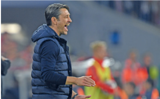
Bayern Munich's Croatian headcoach Niko Kovac reacts on the pitch