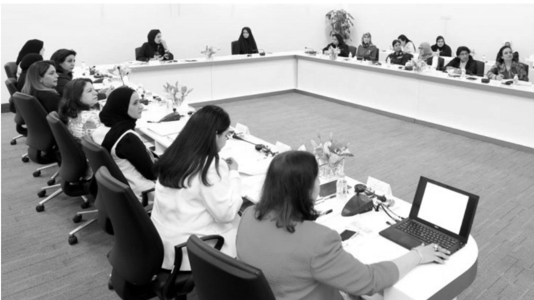
The meeting in progress.

The visions and remarks will be included in the recommendations to be submitted to next month's meeting, set to be chaired by Her Royal Highness Princess Sabeeka bint Ibrahim Al Khalifa, Wife of HM the King and SCW President.