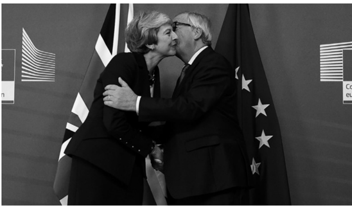
President of the European Commission Jean-Claude Juncker (R) welcomes Britain's Prime Minister Theresa May upon her arrival at the European Commission in Brussels

Before that, British Prime Minister Theresa May must win a parliamentary vote on her government's budget on November