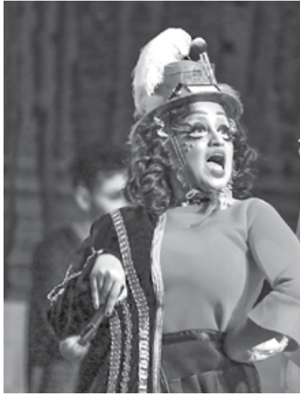
HH Shaikh Khalid bin Hamad Al Khalifa, First Deputy President of the Supreme Council for Youth and Sports, President of Bahrain Athletics Association and Honorary President of Bahrain Sports Federation for Disabilities affirmed that the Youth Theatre Festival is a noble cause, especially given that this year's youth theatre has confirmed the ability of Bahraini youth to perform at a high level.