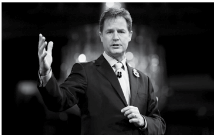
British Deputy Prime Minister Nick Clegg addresses delegates at the annual Confederation of British Industry

Clegg said Facebook was "at the heart of some of the most complex and difficult questions we face" such as "privacy of the