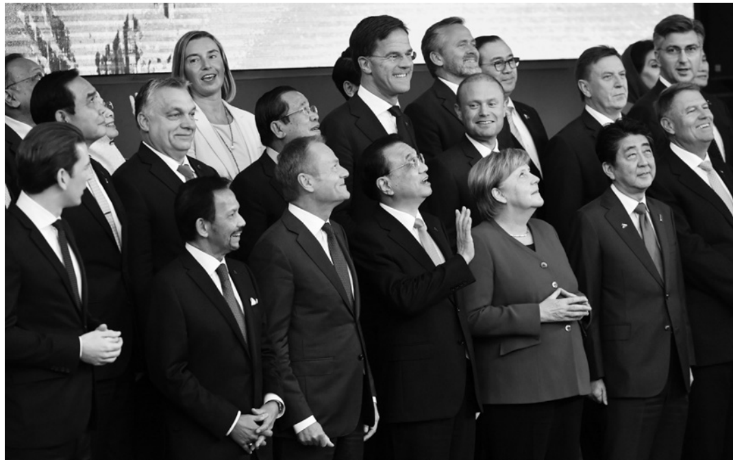
(L/R): Austria's Chancellor Sebastian Kurz, Thailand's Prime Minister Prayut Chan-O-cha, Hungary's Prime minister Viktor Orban, Sultan of Brunei Haji Hassanal Bolkiah, European Council President Donald Tusk, Cambodia's Prime Minister Hun Sen, EU's High representative for foreign affairs and security policy Federica Mogherini, China's Premier Li Keqiang, Netherlands' Prime minister Mark Rutte, Germany's Chancellor Angela Merkel, Malta's Prime minister Joseph Muscat, Japan's Prime Minister Shinzo Abe and officials look up as an unseen drone passes overhead while they pose for a family photograph

The leaders "committed to ensure free and open trade on a level playing field and fight