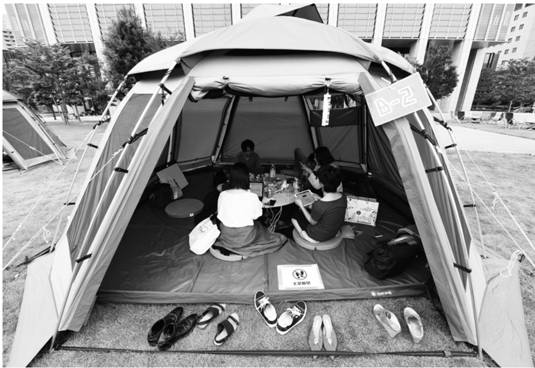
Company employees working inside camping tents erected on the lawn outside an office building in Tokyo