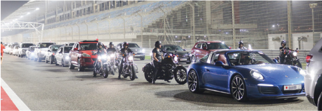
More than 300 cars formed the record-breaking parade.

The event also had many other attractions including Test Drives, Kids Engagement Zone, SME workshops, Innovative Food Truck Festival, live Graffiti shows and panel discussions.