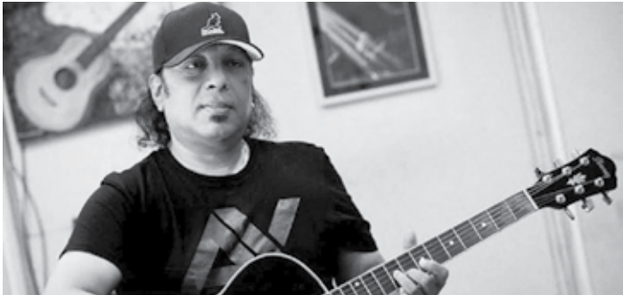
Ayub Bachchu is widely known as AB among his fans

The 57-year-old was also credited with introducing the blues music genre to Bangladeshi audiences and created several smash-hit rock tracks with his band Love Runs Blind.